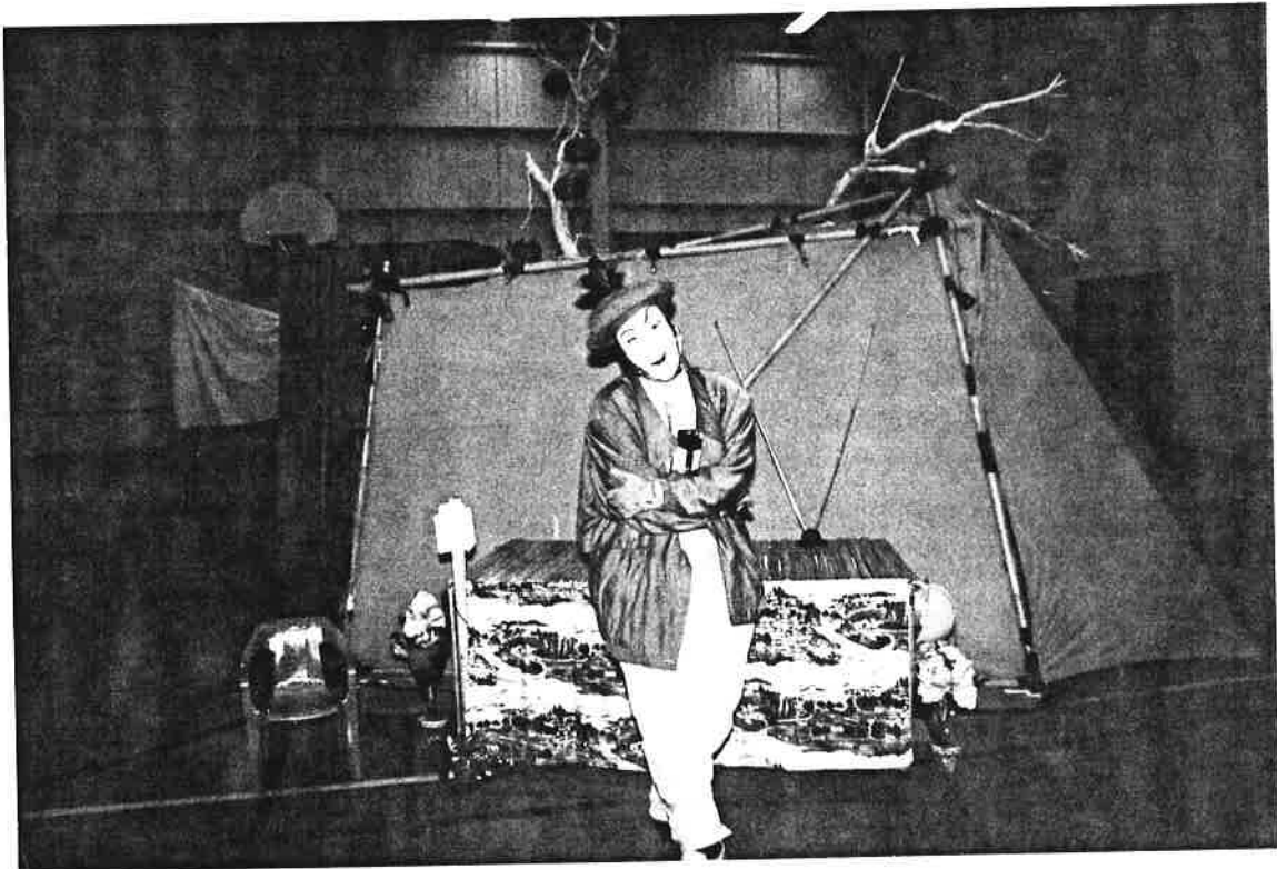
Primus Theatre "For Children Only"

Special fades to black before sounds. End scene.